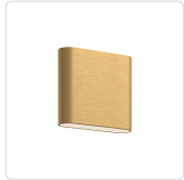
AT6506-BG-UNV Brushed Gold